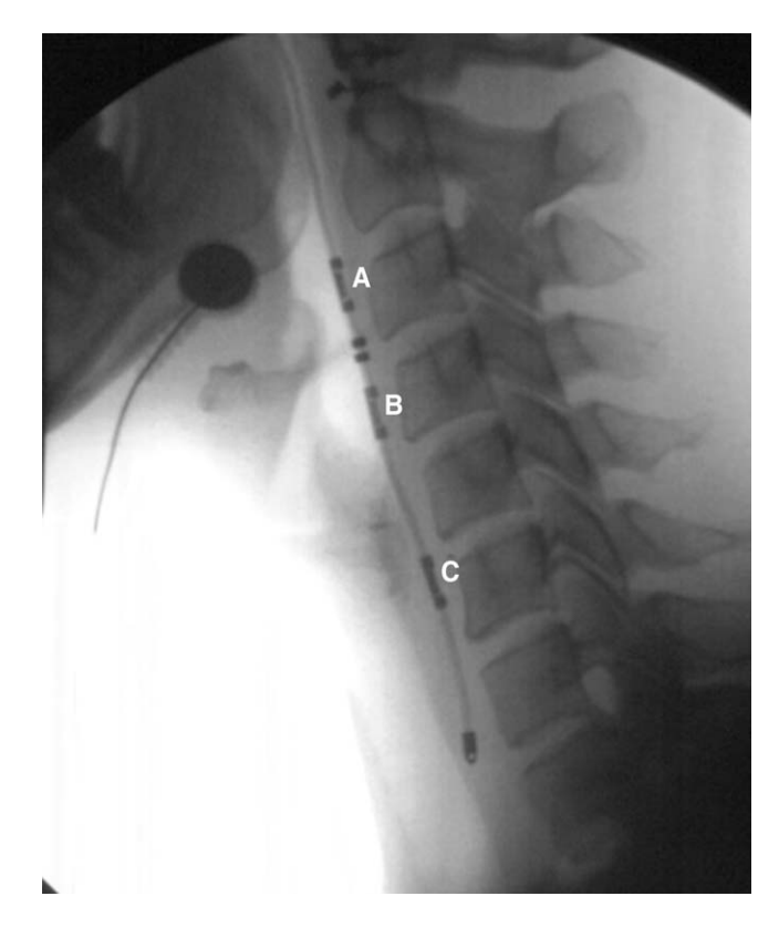
Fig 2. Lateral pharyngeal radiograph with manometric catheter in situ. Three manometric sensors are identified: (A) proximal manometric sensor, (B) mid-pharyngeal sensor, and (C) UES sensor.

We collected data from this study over 2 sessions per participant, counterbalanced for the strategy used to perform the effortful swallow task (with or without tongue-to-palate emphasis). To account for potential intersession variability, nor-